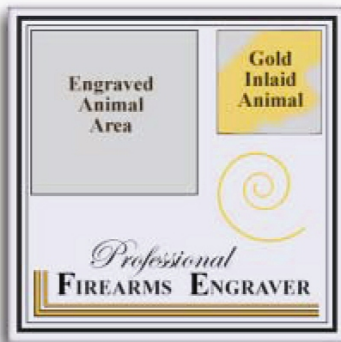
Practice Plate Diagram - Approximation